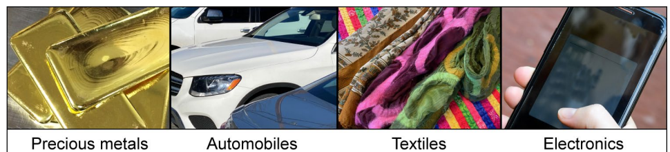
Figure 3: Examples of Goods Commonly Used in Trade-Based Money Laundering Schemes

According to information from different U.S. agencies, international bodies, and partner countries, criminal and terrorist organizations use a wide variety of goods in TBML schemes, but HSI analysis has found the most common items are precious metals, automobiles, clothes and textiles, and electronics (see fig. 3). As of 2018, HSI reported that approximately 70 percent of its TBML-related casework involved these four types of goods. However, criminal and terrorist organizations use any number of different goods in TBML schemes. For example, U.K. government officials told us about a scheme involving the misrepresentation of dental equipment as books in a series of exports from the United States to the United Kingdom.