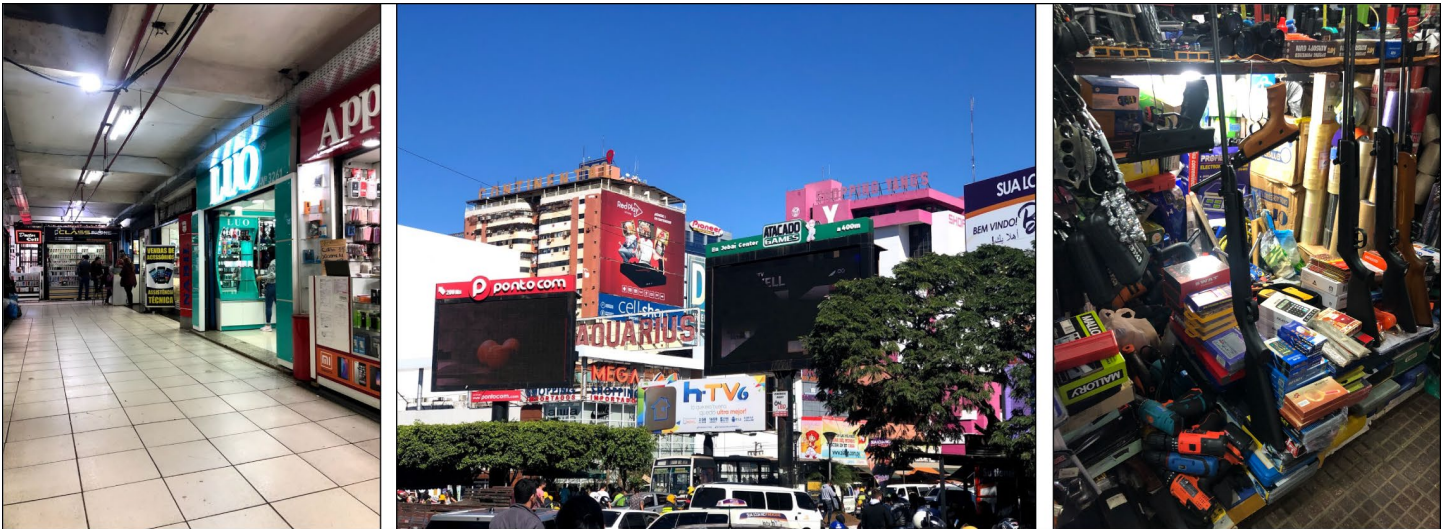
Figure 4: Photos of Commercial Activity in Ciudad del Este, Paraguay in the Tri-Border Area